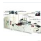
Screen Printing Machine